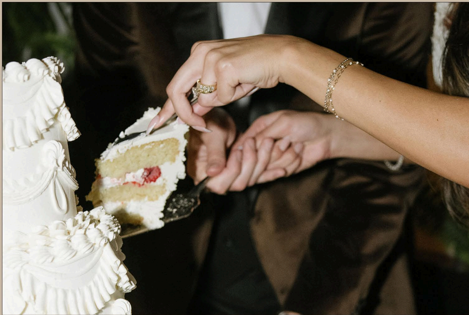
CAKE CUTTING SERVICE