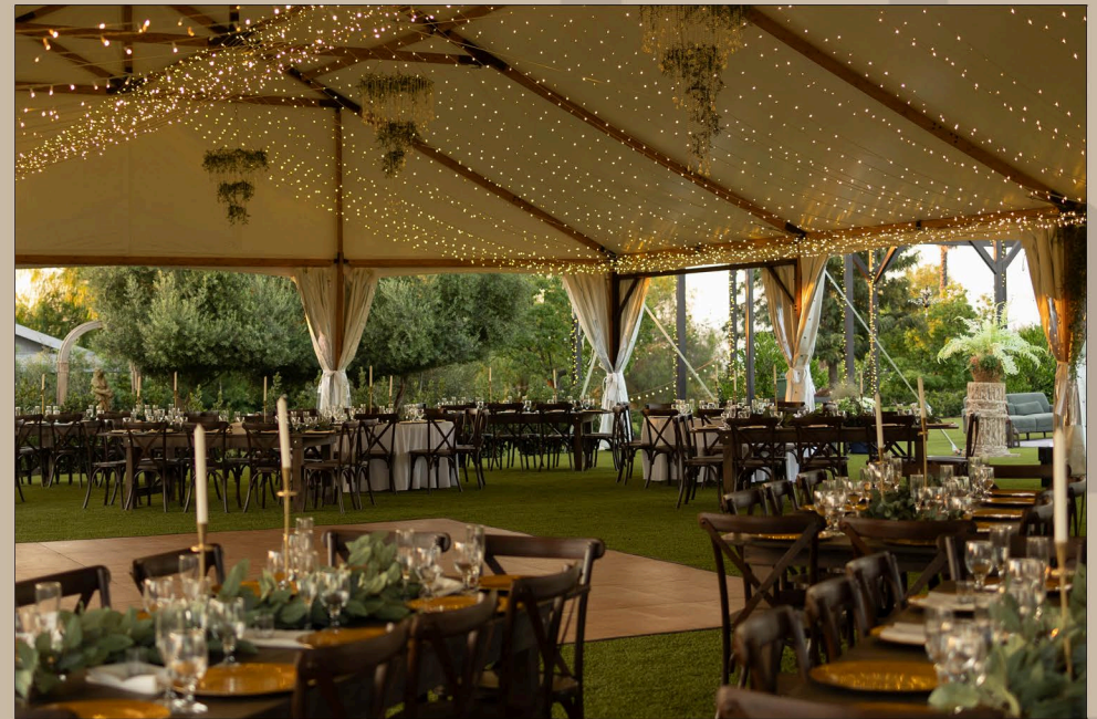
LIGHTING PACKAGES AND DANCE FLOOR