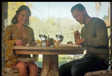
CULINARY TASTING EVENT