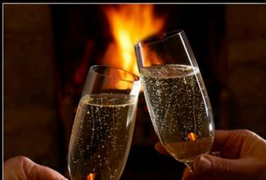
CHAMPAGNE, CALLIGRAPHY & CULINARY EVENT