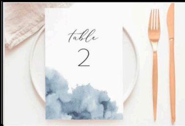
DIY WATERCOLOR TABLE NUMBERS