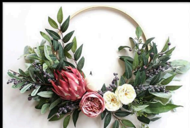
DIY FLORAL PHOTO HOOP WORKSHOP