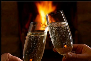
CHAMPAGNE, CALLIGRAPHY & CULINARY EVENT