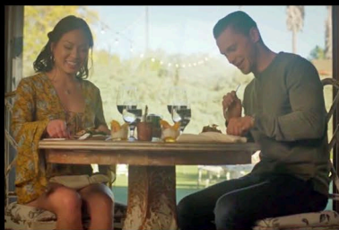
CULINARY TASTING EVENT