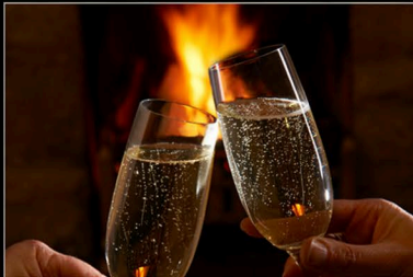
CHAMPAGNE, CALLIGRAPHY & CULINARY EVENT